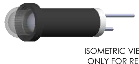
ISOMETRIC VIEW ONLY FOR REF.

The information in this document is the exclusive PROPRIETARY property of VISUAL COMMUNICATIONS COMPANY, LLC . It is disclosed with the understanding that acceptance or review by the recipient constitutes an undertaking by the recipient: (1) to hold this information in strict confidence (2) not to disclose, duplicate, copy, or use the information, in whole or in part, for any purpose other than that for which disclosed