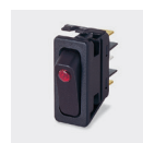
☐ C6003PL - - -