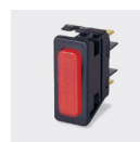
☐ C6030AL - - -