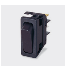
☐ C6000AL - - -