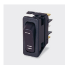
☐ C6010AL - - -