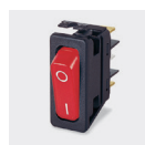
☐ C6003AL - - -