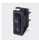
☐ C6000AL - - -