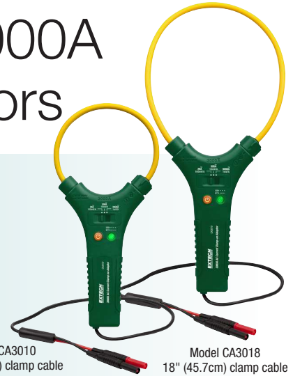
Model CA3010 10" (25.4cm) clamp cable

Expand your meter's capabilities to measure AC Current up to 3000A. Fit most MultiMeters or Clamp Meters with standard shrouded banana plug sockets. Flexible clamp jaw easily wraps around bus bars and cable bundles where standard clamp adaptors and meters can't. The thin 7.5mm cable diameter easily fits into tight spaces. Choose between a 10" (25.4cm) or 18" (45.7cm) clamp cable length.