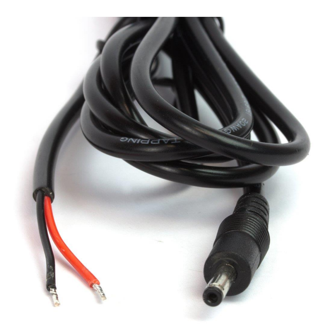
1.5m long power cable /CAB1100