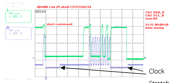
Figure 1. Example waveforms showing clock st

Note that clock stretching can only be performed after completion of transmission of the 9<sup>th</sup> ACK bit, the exception being the START command.