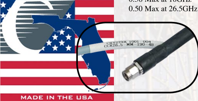
Electrical Test Data Supplied With Each Cable Assembly