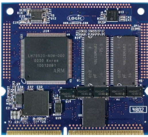
LH79520 CARD ENGINE

The LH79520 Card Engine is ideal for applications in the medical, point-of-sale, industrial, and security markets. From patient