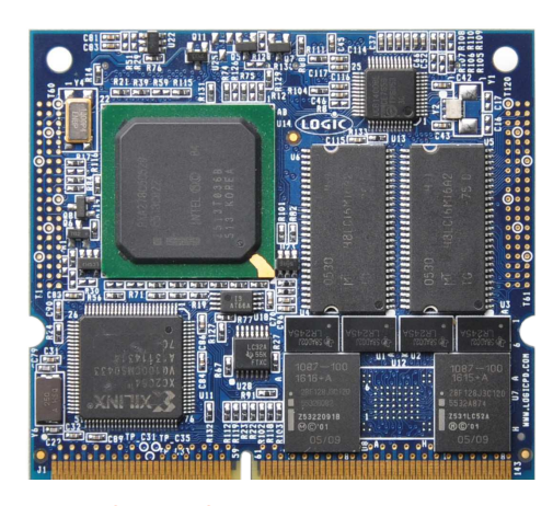
PXA270 CARD ENGINE

The PXA270 Card Engine is ideal for applications in the medical, point-of-sale, industrial, and security markets. From patient