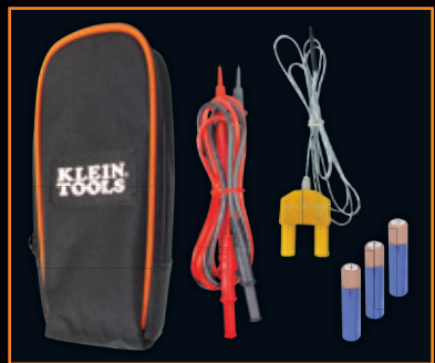
Includes pouch, test leads, thermocouple and batteries