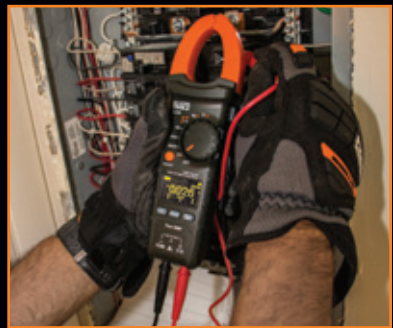
Replaceable test leads for measuring voltage, resistance, capacitance, continuity, etc.