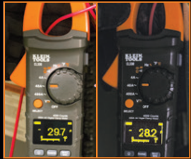
Super-bright OLED display is highly visible in both bright and low-light environments