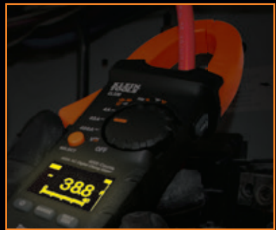
Large clamp opening for non-contact measuring of AC current