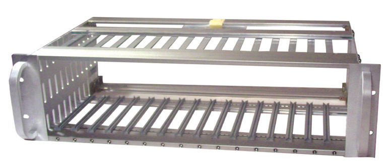
CCM13S/90 - shown fully assembled includes dress panels and handles