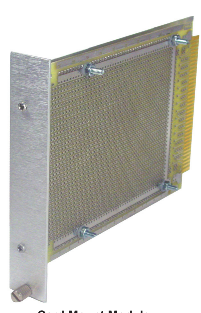
Card Mount Module Plugbord™sold separately