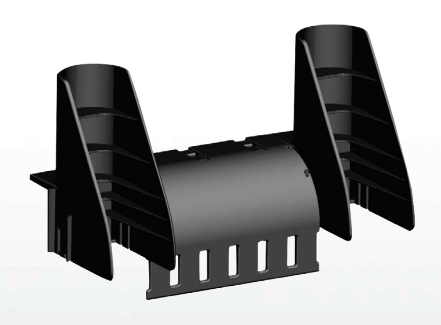
CMW-KIT Waterfall Kit