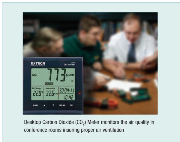
Desktop Carbon Dioxide (CO 2 ) Meter monitors the air quality in conference rooms insuring proper air ventilation