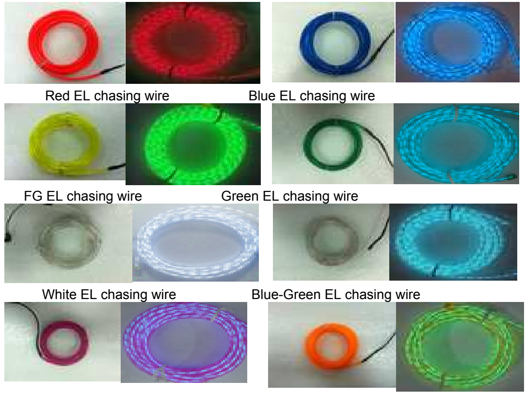
Purple ELchasing wire