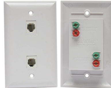
CP-V413PS VDSL2 Video-Grade CPE Splitter

The CP-V413PS Video-Grade CPE Splitter is one of many splitters and filters manufactured by Excelsus, a brand of Pulse, for digital services within homes, offices, and hotels. Excelsus is the number one selling brand of DSL filters and splitters worldwide.