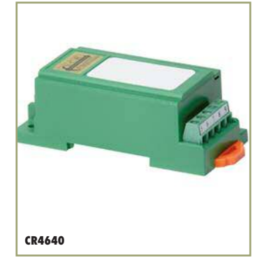
Two Element Transmitter 50 to 500 VAC Input Range

CR Magnetics has a wide selection of Potential Transformers to extend the range of any part. Contact factory for more information.