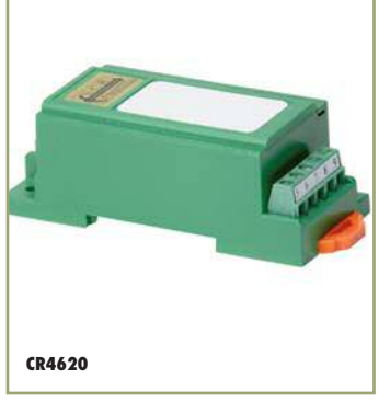
Single Element Transmitter 50 to 500 VAC Input Range