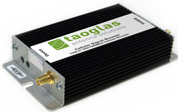
1: CSB.01 Amplifier Unit