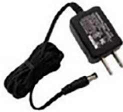
2: AC/DC Power Adaptor