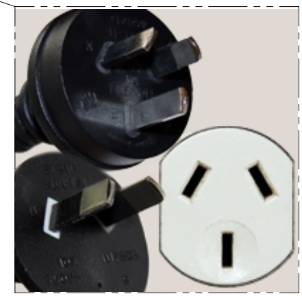
PLUG STYLE: TYPE "I"