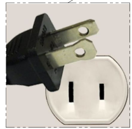
PLUG STYLE: TYPE "A"

Go to www.panduit.com for more information.