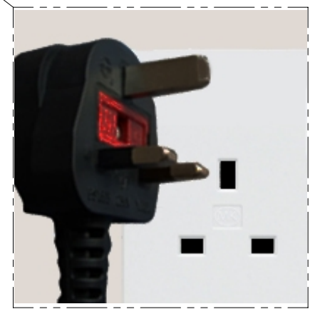
PLUG STYLE: TYPE "G"