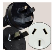
Plug Type I (Australia)