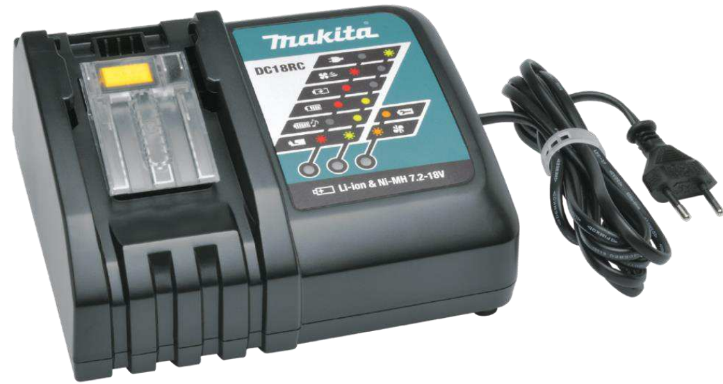
18 VOLT BATTERY CHARGER

See Images Below for an illustration of Plug Types.