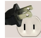
Plug Type A (North America)