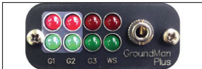
Figure 3. LED lights used to set resistance alarm level.

Verification of G1, G2 and G3 monitoring.