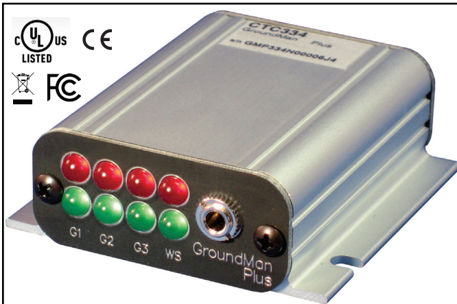
Figure 1. Ground Man Plus Ground Monitor.