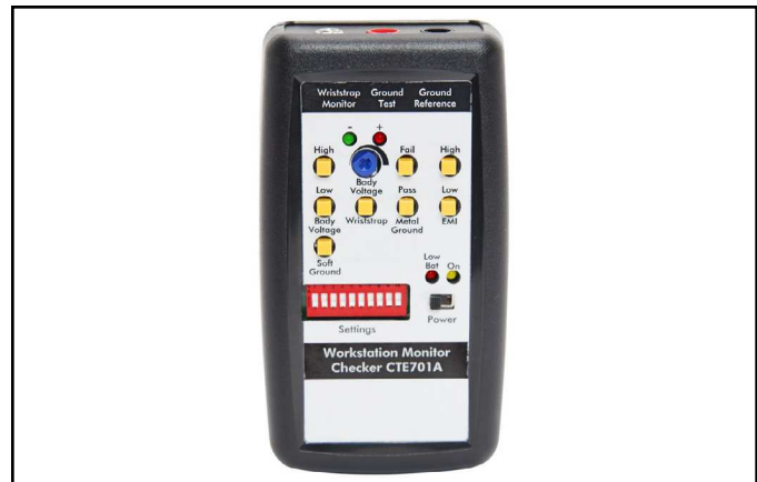
Figure 3. SCS CTE701 Workstation Monitor Checker

The checker verifies the proper operation of dual wrist strap monitoring. Connect a 3.5 mm test cable to both the checker and to the operator jack of the monitor. At this point the monitor should indicate failure. Depress the Pass button on the wrist strap section. The monitor should indicate a good connection. While pressing the Pass button, press body voltage “high.” At this point the Wrist Strap LED would be blinking red.