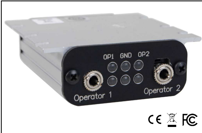
Figure 1. SCS CTC337 Wrist Strap and Ground Monitor