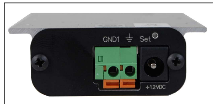
Figure 2. Rear view of Wrist Strap and Ground Monitor

Attach 18 AWG wires to the unit as described below. Strip back the vinyl insulation at each end of the wires to approximately 1/3 inch (8 mm). Twist the stranded wire on each end before inserting the wire into each connector location. In order to attach the wire, insert a small blade screwdriver into the orange slot above. Gently push inward and insert the stripped wire fully into the hole in the green connector. Hold the wire fully in and release the screwdriver to allow the wire to catch. Attach the green monitor ground cord to the ground connector on back of unit. Attach the impedance monitor wire to the “GND1” connector on the back of the unit.