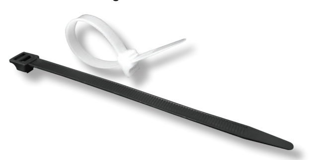
CTRL Lashing Tie