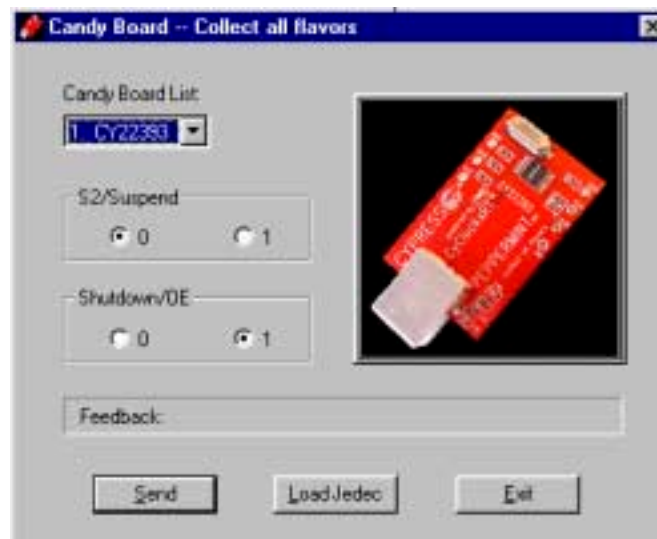
Figure 1. Candy Board Set-up Window

Windows is a trademark of Microsoft Corporation. CYClocksRT™ is a trademark of Cypress Semiconductor Corporation. All product and company names mentioned in this document are the trademarks of their respective holders.