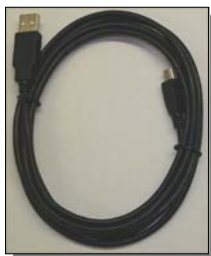
USB Cable (6ft/2m)