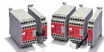
G9SA Series Safety Monitoring Relays