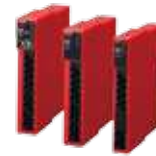
G9SE Series Safety Relay Unit

Every switch needs to be monitored. Visit www.omron247.com to learn more about our complete line-up of safety monitoring relay units and programmable safety controllers.