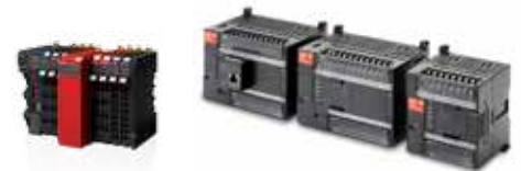
NX-S Sysmac Safety System