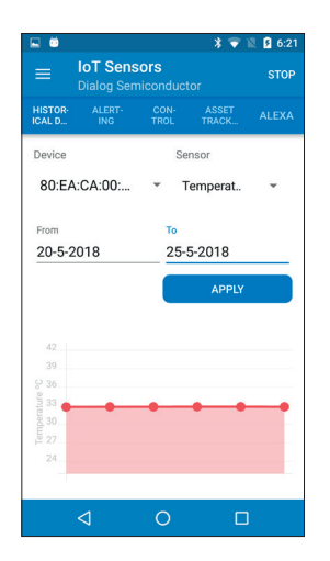
Figure 1: Showing the historical data

The kit's cloud connectivity opens up new possibilities such as visualization of historic data with data analytics, remote sensor management, Alexa voice command support, alert notifications and cloudbased actuator control.