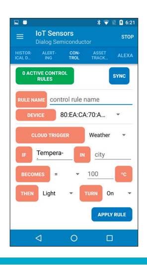
Figure 2: Showing the conditional control in the cloud