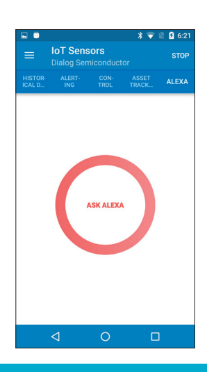
Figure 3: Asset tracking with Alexa