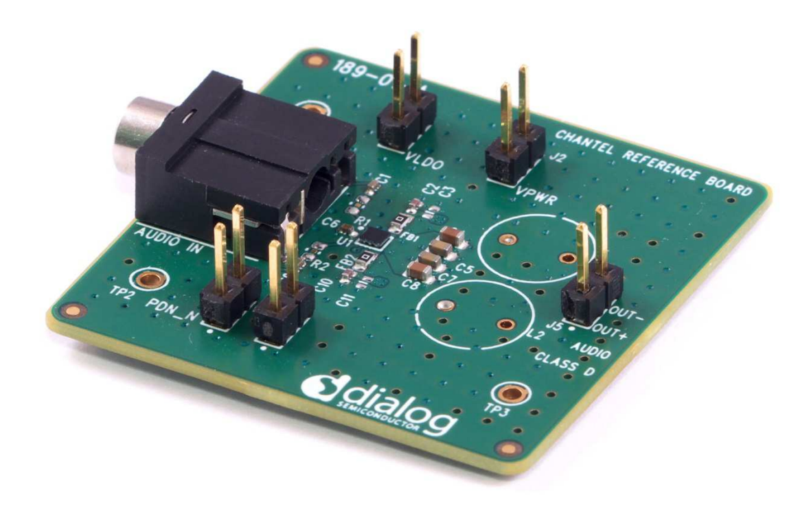
Figure 1: DA7202 performance EVB

The evaluation board (EVB) is supplied with a USB memory stick containing supporting collateral.