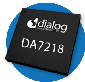
32 ball WLCSP package, 0.5 mm pitch

DA7218 contains two analog microphone input paths, or up to four digital microphone input paths, or a combination of both. The other chip in this family, the DA7217 has differential headphone outputs without headphone detect, and has been designed for use inside headset devices.