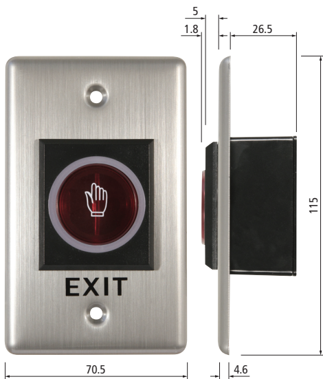
All dimensions in mm