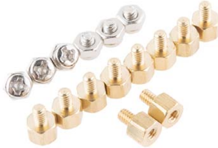
Intel Edison Hardware Pack