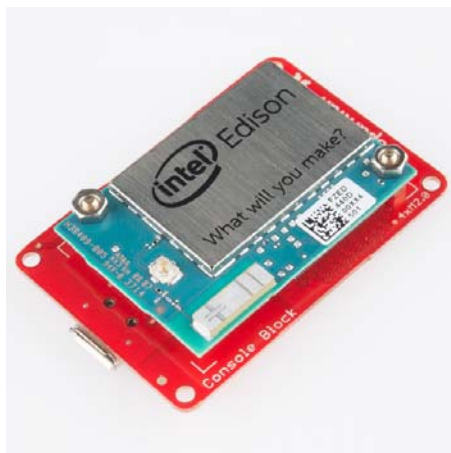
Console Block Installed

To use the console Block, attach an Intel Edison to the back of the board, or add it to your current stack. Blocks can be stacked without hardware, but it leaves the expansion connectors unprotected from mechanical stress.