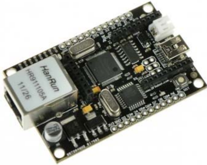
X-Board V2, DFR0162