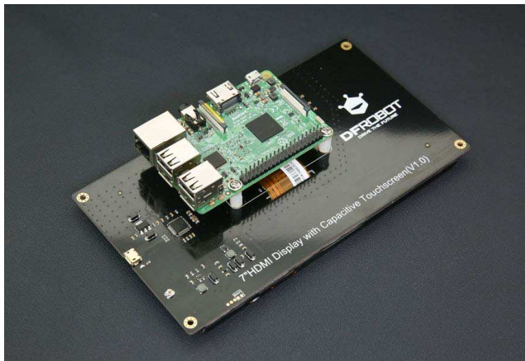
7" HDMI Display with Capacitive Touchscreen SKU: DFR0506