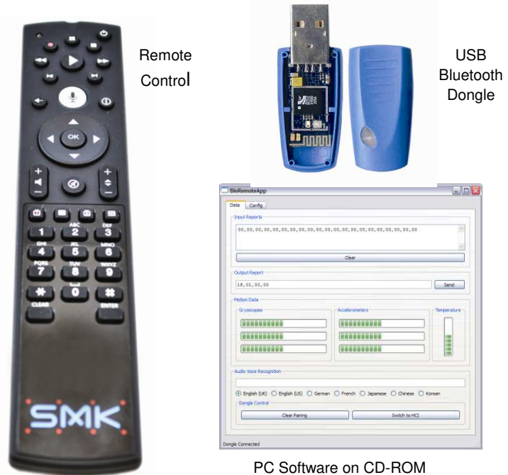
PC Software on CD-ROM