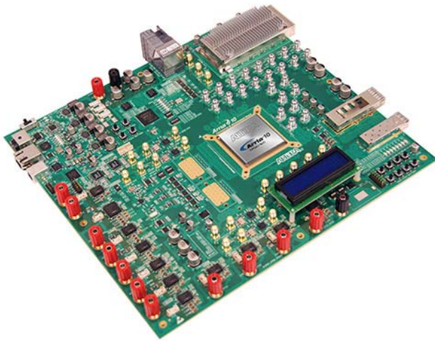
Figure 1. Arria 10 GX Transceiver Signal Integrity Development Kit

Altera's Transceiver Signal Integrity Development Kit, Arria® 10 GX Edition helps you thoroughly evaluate the signal integrity of Arria 10 GX transceivers. This development kit delivers a complete design environment that includes all hardware and software you need to start taking advantage of the performance and capabilities available in Arria 10 GX FPGAs.