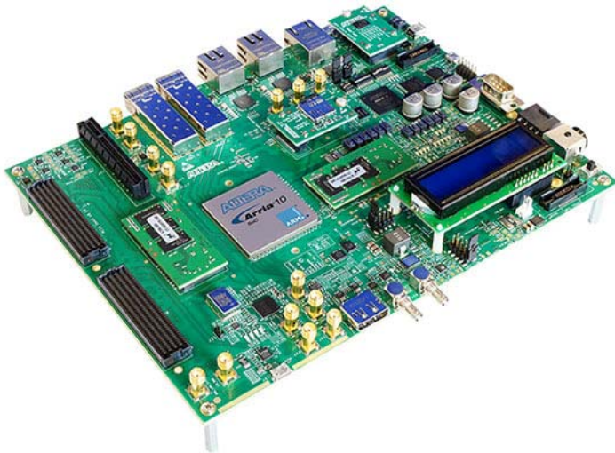
Figure 1. Arria 10 SoC Development Kit

*Application-specific daughter cards, available separately, supporting a wide range of I/O and interface standards