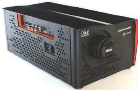
DLP LightCommander Development Kit

The DLP LightCommander takes DLP development to a new level. The fully self-contained kit benefits developers looking to