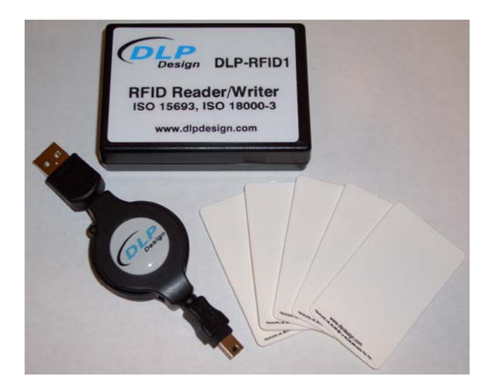
Retail Version: Includes reader, USB cable and five peel & stick RFID tags