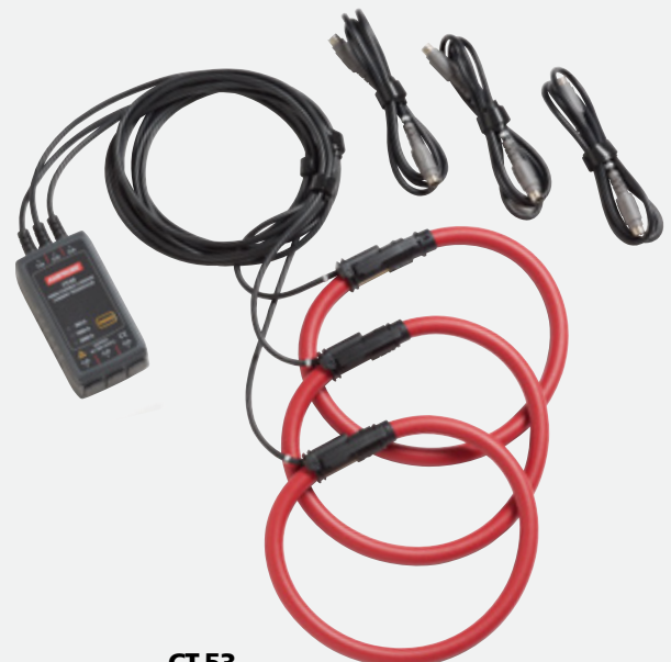
CT-53 Flex Current Sensor

← . . . . High performance processor for accurate, detailed data recordings