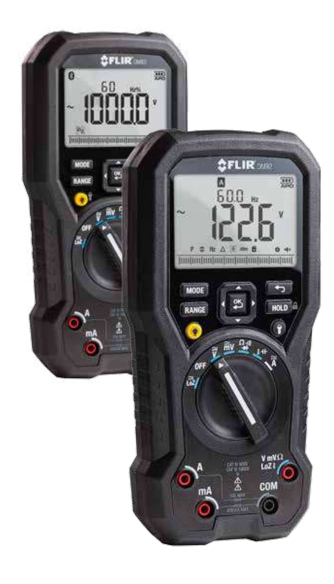
DM92 and DM93 feature powerful LED worklights