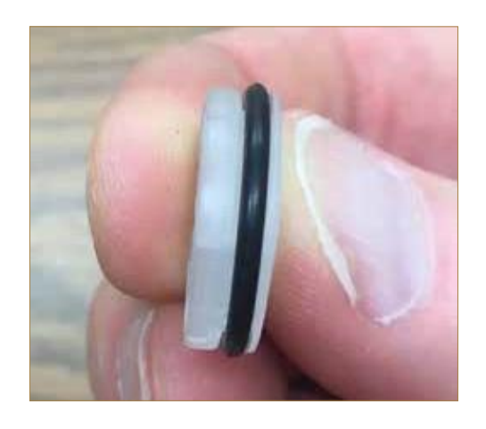
NEW PISTON SEAL DESIGN