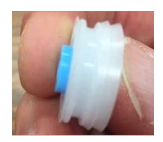
BETTER CHEMICAL COMPATIBILITY