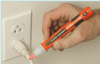
Quickly check for the presence of live wires before testing