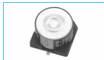
Marking color : White print on an brown sleeve