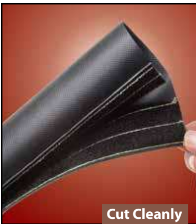
Cut Cleanly Scissor