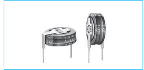
Marking color : White print on a black sleeve