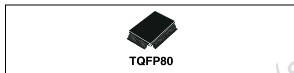
Table 1. Order Codes