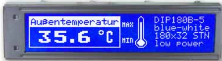
EA DIP180B-5NLW Dimension 102 x 27 mm