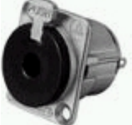
Click here for 1/4" Jacks