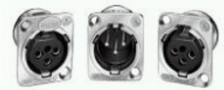
Click here for full line of E Series XLRs

+ Reversible gender. ~ Connector is flush with the face of the housing. If no "B" suffix, all connectors come with nickel housing. If no "PKG" suffix, all connectors come bulk.