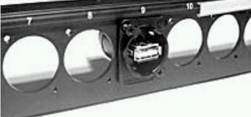
Unloaded 1 RU EH Rack Panel

Note: All panels come with cable tie bar