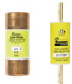
Current-limiting, time-delay Class J Low-Peak™ fuses