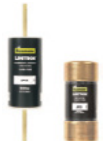
Current-limiting, fast-acting Class J Limitron™ fuses