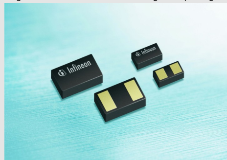
Figure 2 - TSSLP-2 and TSLP-2 single line packages.