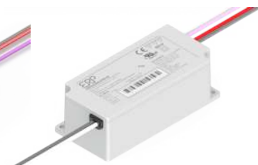
ESST Plastic Case (ESST40 only) L 84 x W 40 x H 27 mm (L 3.30 x W 1.57 x H 1.06 in)