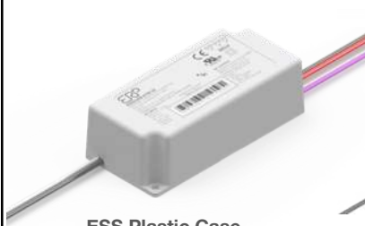
ESS Plastic Case L 84 x W 40 x H 25 mm (L 3.30 x W 1.57 x H 0.99 in)