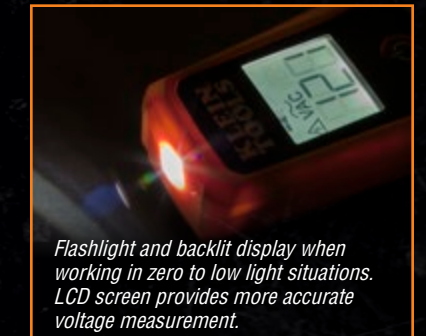
Flashlight and backlit display when working in zero to low light situations. LCD screen provides more accurate voltage measurement.