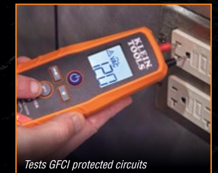
Tests GFCI protected circuits