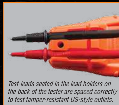
Test-leads seated in the lead holders on the back of the tester are spaced correctly to test tamper-resistant US-style outlets.